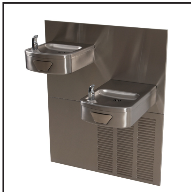
"INDOOR USE ONLY"

Please visit www.murdockmfg.com for most current specifications.