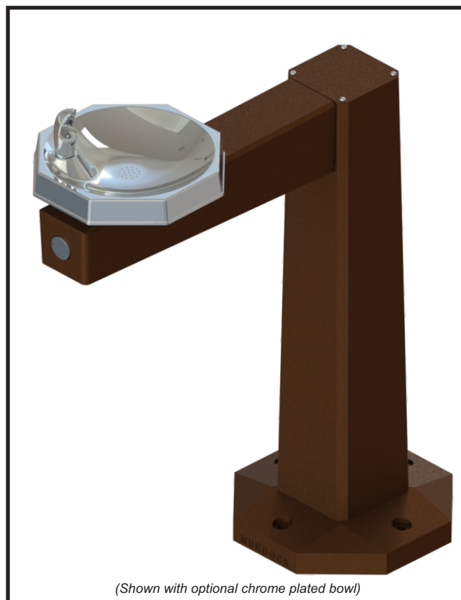
(Shown with optional chrome plated bowl)

All solid brass castings shall conform to ASTM standards B61 and B62. Unit shall conform to ANSI A117.1, 2010 ADA Standards for Accessible Design, ANSI/NSF 61-9, and Public Law 111-380.