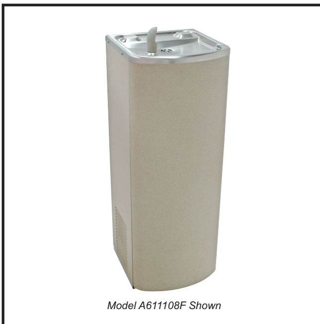
Model A611108F Shown

Please visit www.murdockmfg.com for most current specifications.