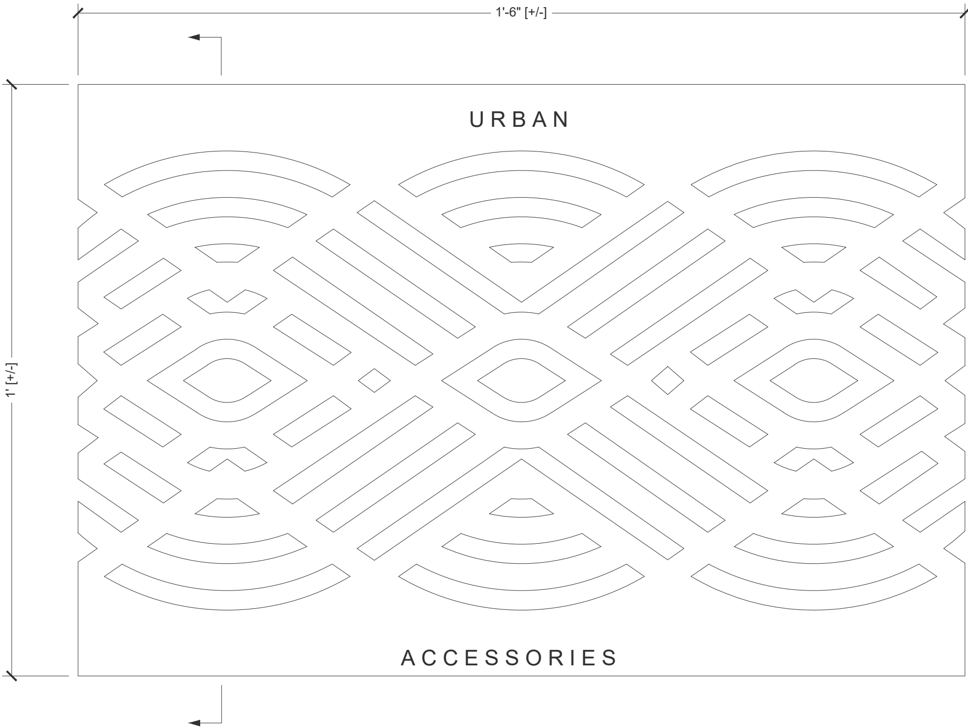
Plan Scale: 6" = 1' 0"