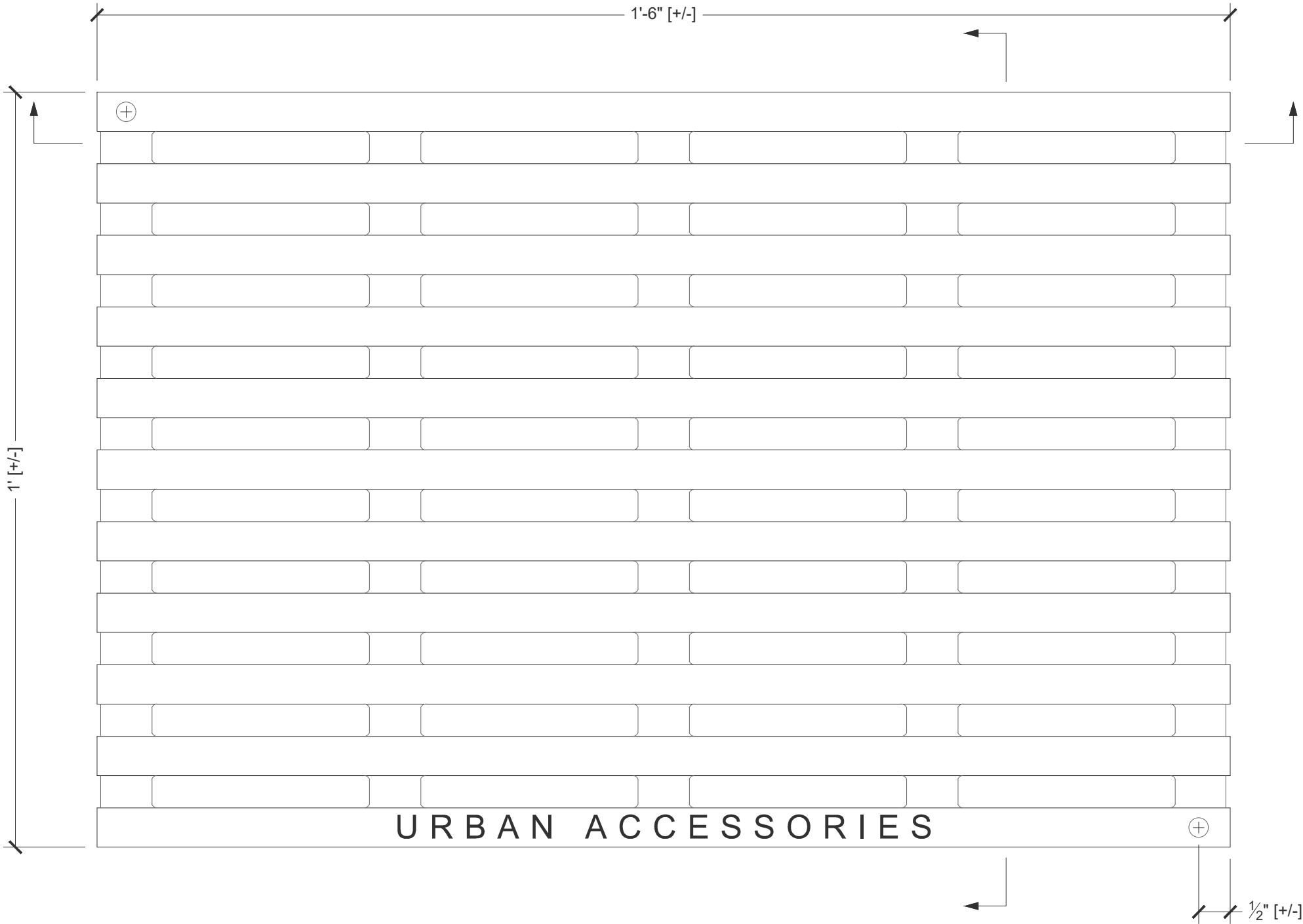
Plan Scale: 6" = 1' 0"