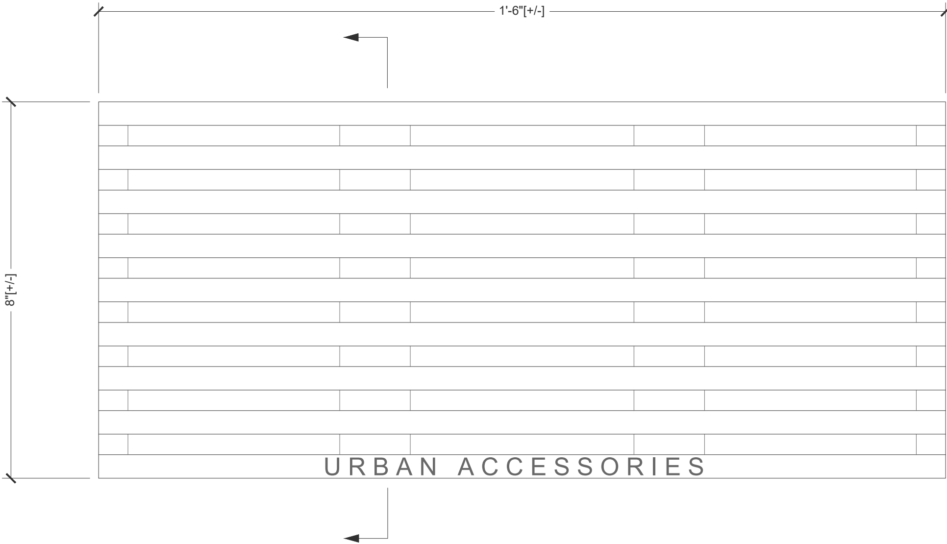
Plan Scale: 6" = 1' 0"